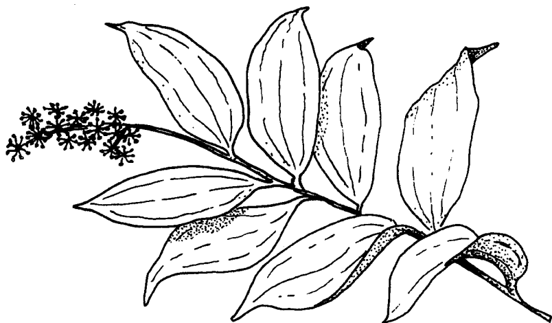
False Solomon's Seal

Please do not remove native plants from the wild. It can alter the natural habitat and deplete native populations. Most wild-collected plants do not survive transplanting. Growth conditions for some natural areas are difficult to reproduce in the home landscape. For these reasons, make sure that the native plants you buy are nursery-grown.